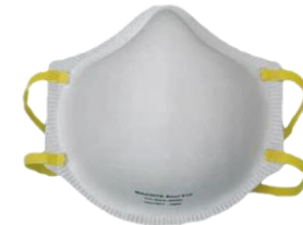
P2 or N95 mask