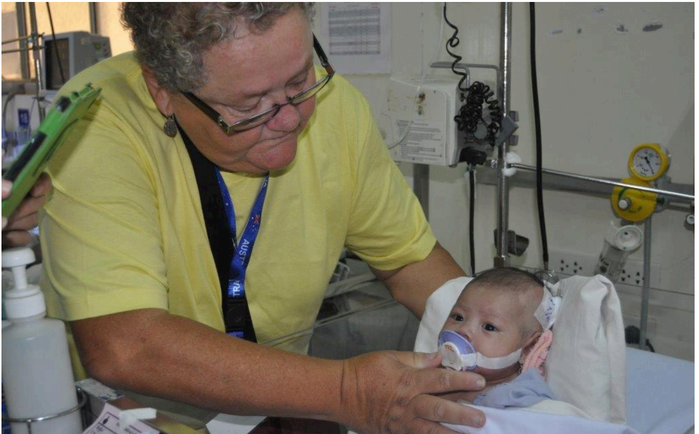
"Nurturing needy newborns"